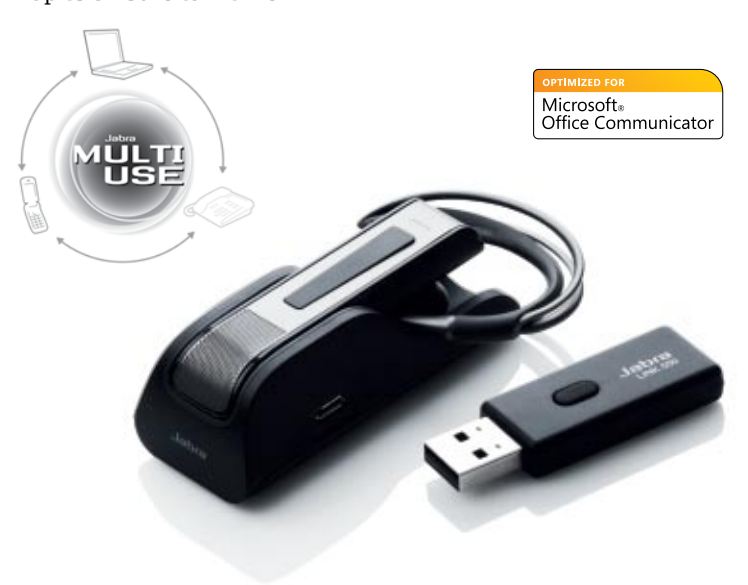
GN Netcom is a world leader in innovative headset solutions. GN Netcom develops, manufactures and markets its products under the Jabra brand name