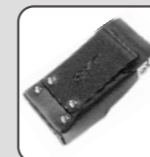
Leather Case CA-3600A