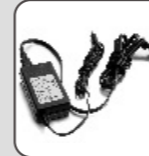
Adapter PDS-268 (90-260V 12V 1000mA)