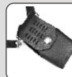
Leather Case CA-3000A