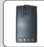
Li-ion Battery TB-64 7.2V 1700mAh