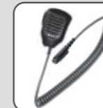
Remote Speaker Microphone SM-06Z