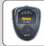
Rapid Charger HC3000Li